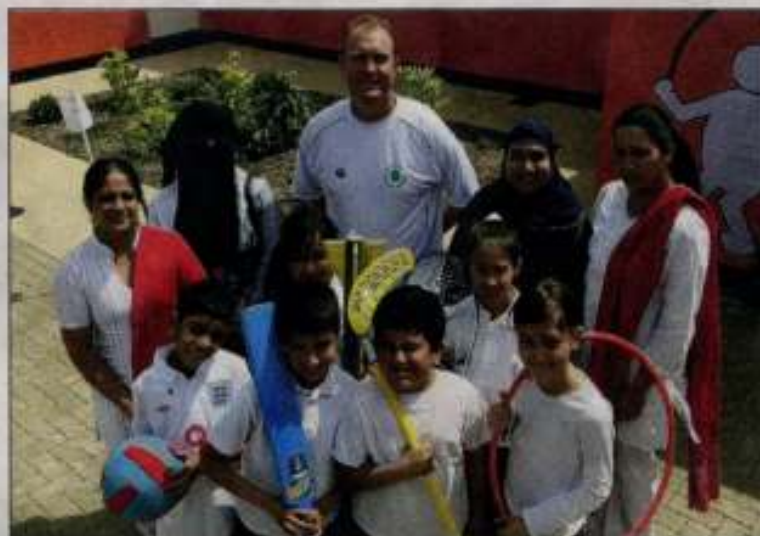
Cash boost: staff, parents and children from Beech Hill School, Halifax, have got a grant for after-school healthy activities