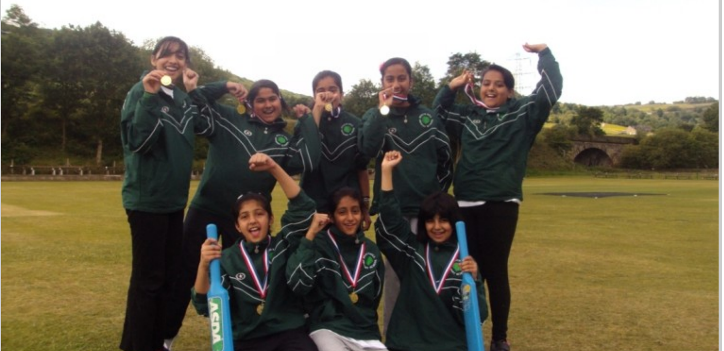
Our Winning Team

Over the last few weeks pupils from year 5 and 6 Girls Cricket Team have been competing with schools throughout Calderdale, recently. On 17th May they won the heats at Halifax High and went through to compete against all areas of Calderdale.