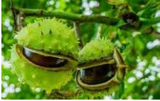
Horse chestnut tree