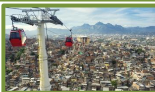
Cable cars over a town in Rio de Janeiro