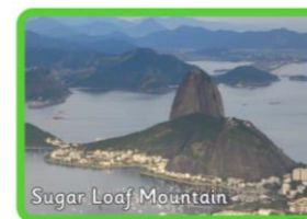
Sugar Loaf Mountain