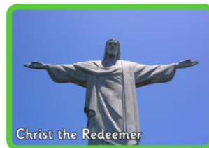
Christ the Redeemer